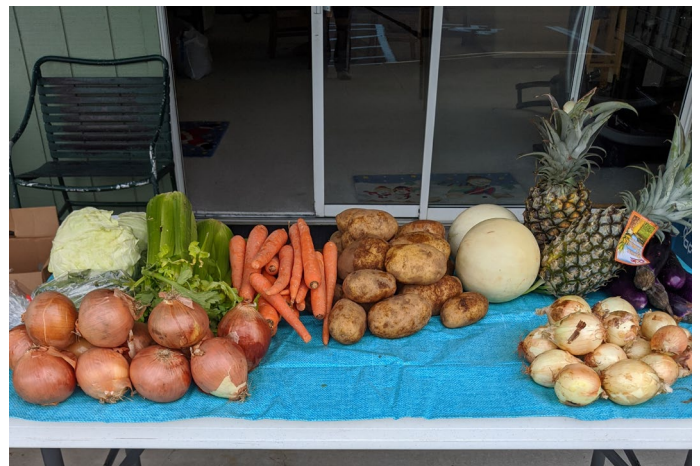
Fresh fruit and vegetable donations for residents at Waimea Elderly.

A donation of fresh vegetables and fruits was also received and distributed among households.