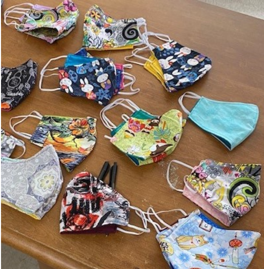
A variety of cloth masks donated to Kea’au Elderly.

Also, Aloha Nazarene Church-Pre-school donated goodies and canned food for each household at Kea’au Elderly.